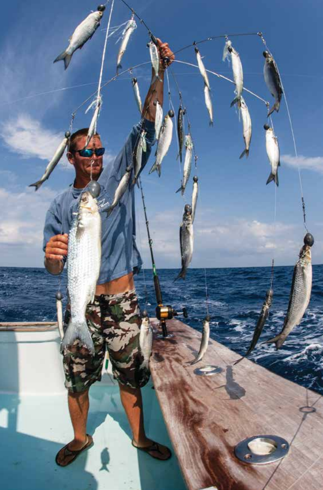
Plenty of fresh mullet for dredges gets the attention of sailfish.