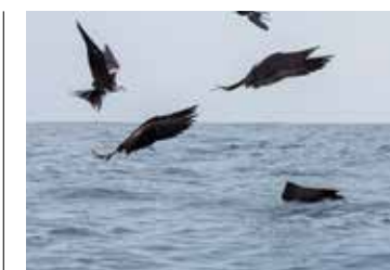
With or without a sail visible above the surface, a gathering of excited frigates just over the water shouts: "Fish here!" to any experienced captain or angler.

Yates seldom moves if he's catching at least occasional fish, with one exception. "If you're picking up a few fish, but so is everyone else, and you know it won't be enough to win, you might try a Hail Mary,"